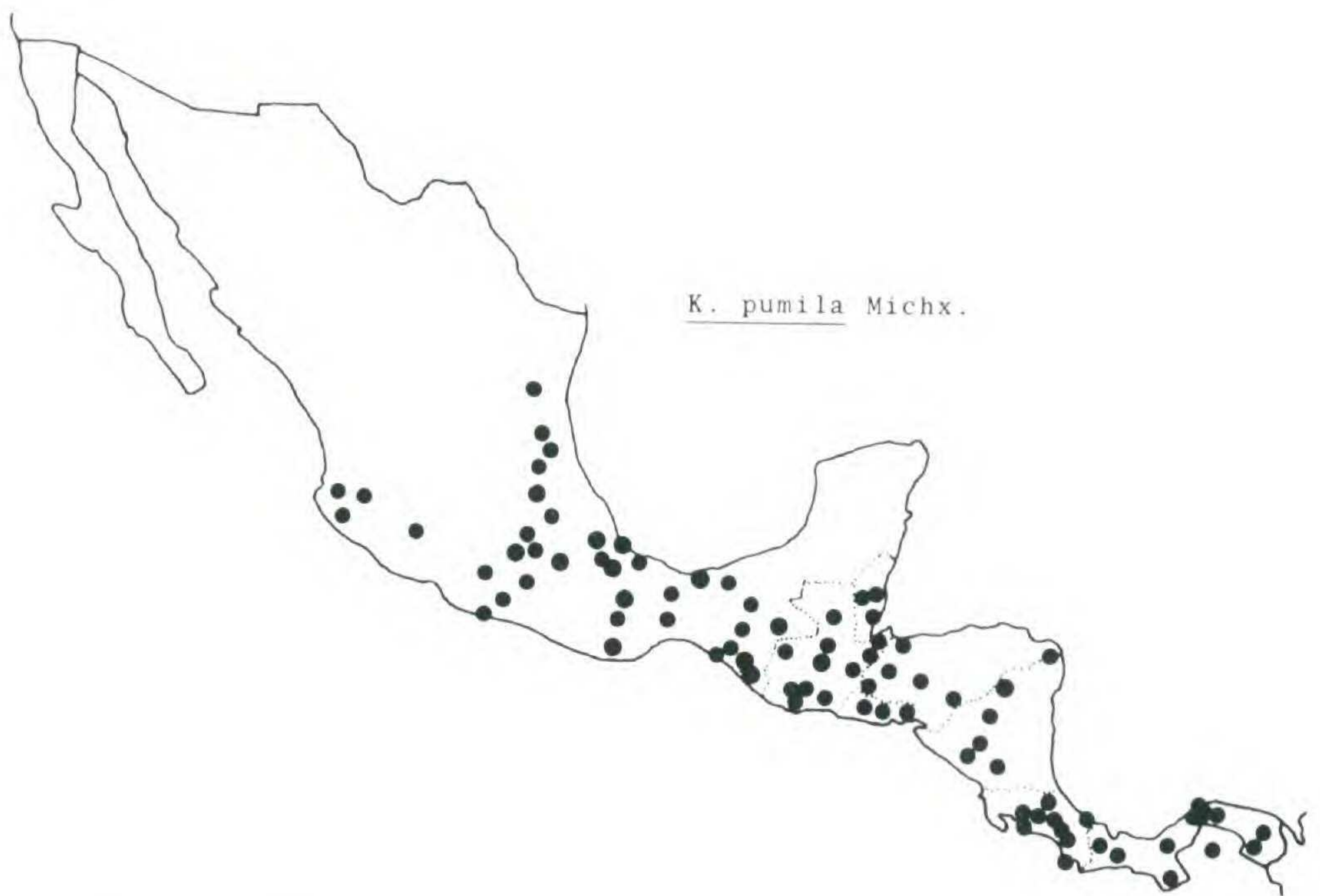
Figure 1. Distribution of K. pumila in Mexico and Central America.

PHENOLOGY. Flowers and fruits throughout the year.